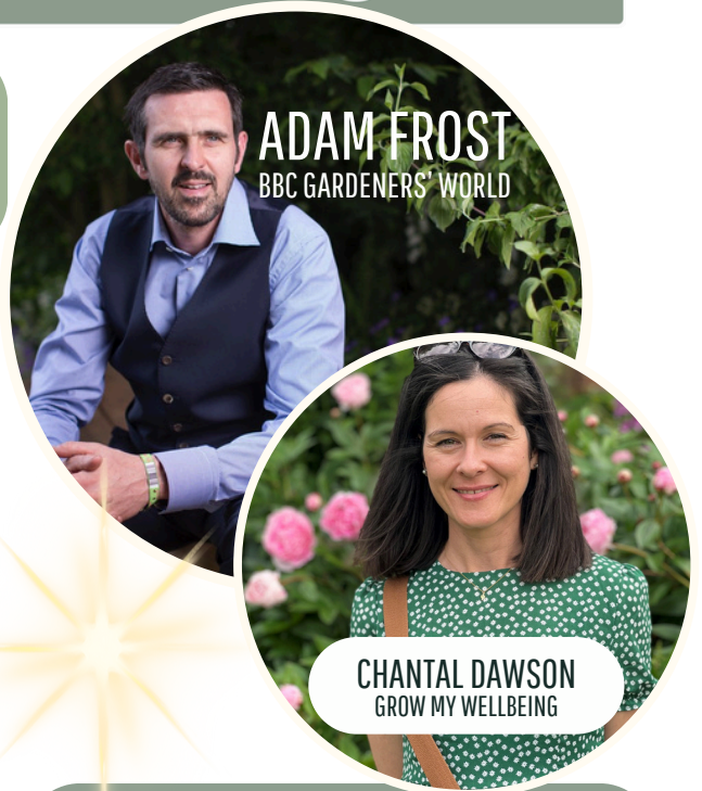
ADAM FROST BBC GARDENERS' WORLD